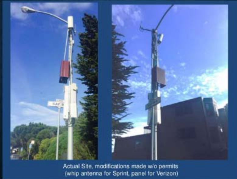
Actual Site, modifications made w/o permits (whip antenna for Sprint, panel for Verizon)