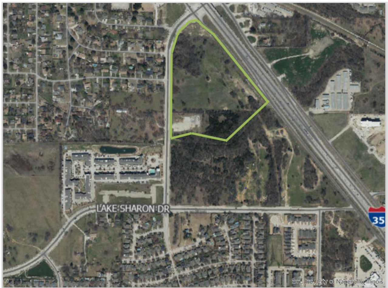
EXHIBIT "B" PROPERTY